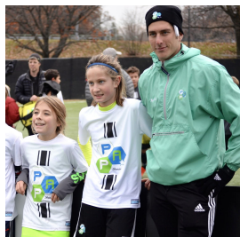
Awesome Gear & Swag